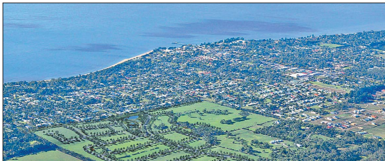
Aerial image of Seagrove