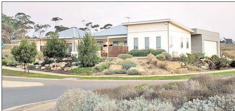
House on Seagrove Way.

Home sites in the new Egret release are priced from $146,900. For more information call 1800 61 61 06, or visit www.seagrove.com.au or Stockdale and Leggo in Cowes.